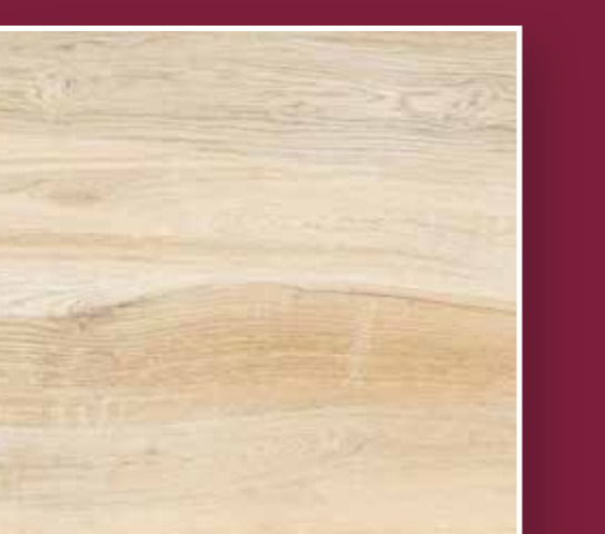
UI Acrylic Dead Matt