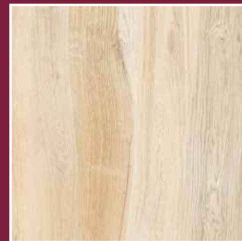
UI Acrylic Glossy

Ultra Italia Acrylic PU is two-components acrylic glossy top coat, with high, transparency, clarity, high gloss level and non-yellowing properties.