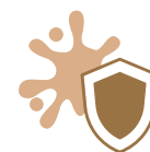
Resistance to Abrasion and Chemical Agents