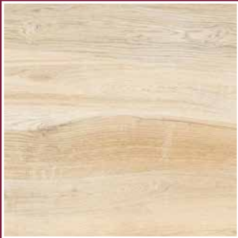
UI Acrylic Dead Matt

It gives elegant dead matt and natural look to the furniture, also provides aesthetic quality to wood. It provides rich natural look without covering intricate grains and texture of wood.