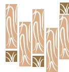
Retains Natural Look of Wood